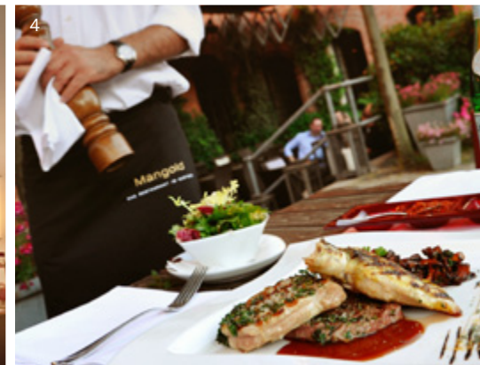
1 Denk.mal Hall · 2 L.BAR at the Gastwerk · 3 Atrium room · 4 Mangold restaurant summer terrace